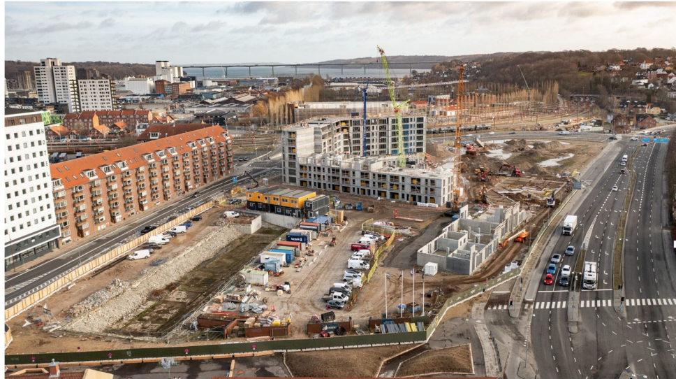
September 2023 – on going construction of residential structure – sold part of project. Pile foundation of S6 (machine) 50% complete.